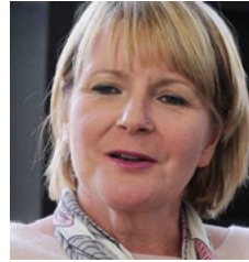
Kathryn Stone OBE Parliamentary Commissioner for Standards